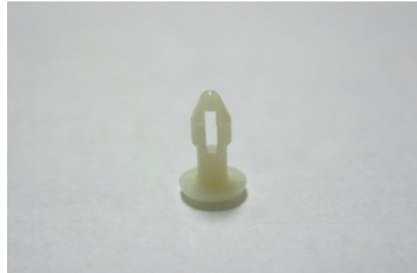
30-515 Long Shank Rivet – Fits a 1/4" hole.