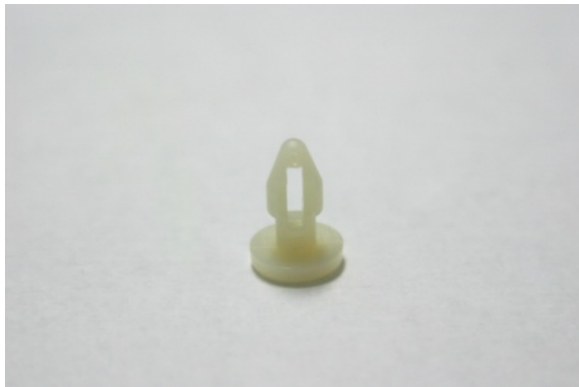
30-516 Short Shank Rivet – Fits a 1/4" hole.

Chair Care Patio offers three different types of rivets that can be used for single wrap or double wrap strap applications. In order to determine which rivet you will need careful inspection of the chair frame is required. If the rivet hole is flush (no indentation) and located on the inside of the chair frame, the short shank (30-516) rivet will be used. If the rivet hole is pressed or bears a slight indentation where it was pressed into the chair frame and is located on the inside of the frame, a long shank rivet (30-515) will be used. The long shank rivet has a slightly longer neck which allows the rivet to seat firmly into the pressed (indented) rivet hole. Holes located on the bottom side of the chair frame will use a double wrap solid shank rivet (30-512).